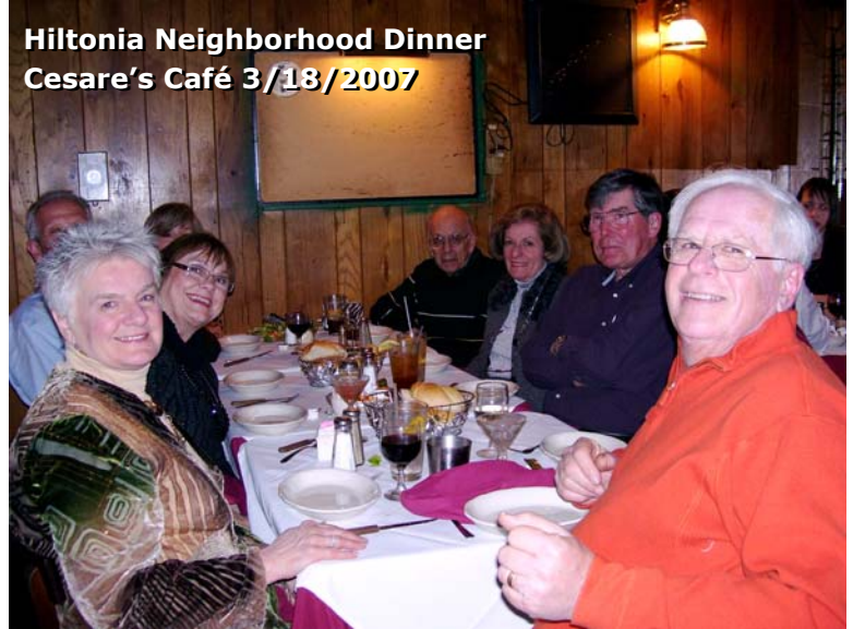
Hiltonia Neighborhood Dinner Cesare's Café 3/18/2007